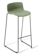
Unica Mini Upholstered Stool