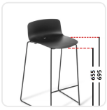
655mm Seat Height