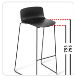
755mm Seat Height