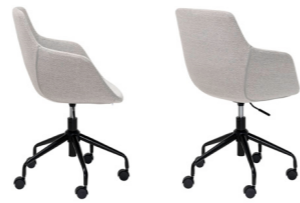
Side view Back angle view

A modern tub chair design with generous seat width and depth for optimal comfort.