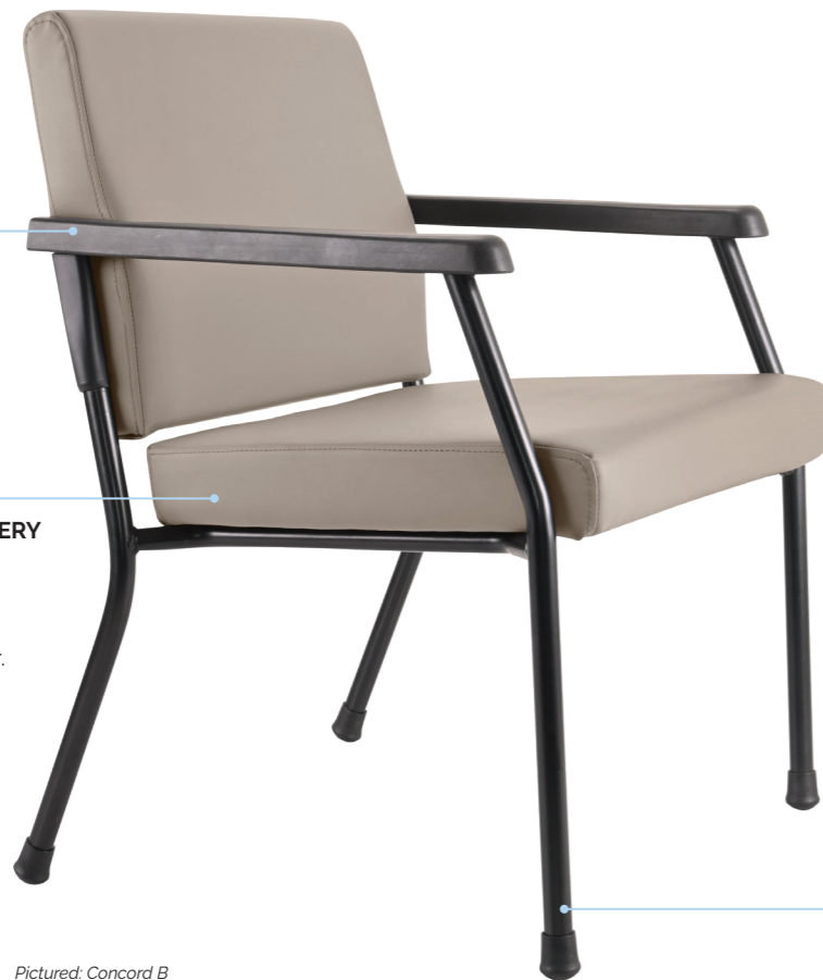
Pictured: Concord B

ANTI-MICROBIAL UPHOLSTERY Dillon PU is a heavy-duty fabric with Silver-based Ion Technology, designed to withstand high wear and tear.