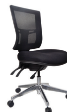
Featured with aluminium base