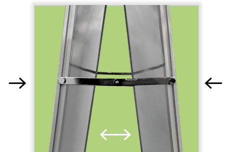
Fold in flat and store feature