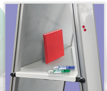
Removeable storage shelf 915mmL x 190mmW