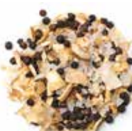
LEMON & PEPPER TOP SELLER