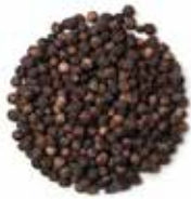
BLACK PEPPERCORNS TOP SELLER