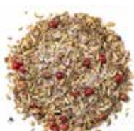
HERB & SPICE SEASONING TOP SELLER