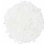
WHITE HYMALAYAN SALT