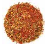
DEEP SOUTH CAJUN