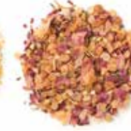
LOVE SALT TOP SELLER