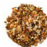
SEAFOOD & FISH SEASONING