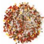
HOT & SPICE MIX