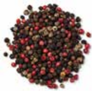
ASSORTED PEPPERCORNS TOP SELLER