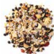
GRILLING & ROASTING TOP SELLER