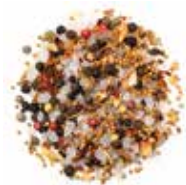
BBQ & GRILL MESQUITE