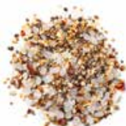
MONTREAL STEAK SPICE TOP SELLER