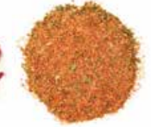
FRENCH FRY SALT