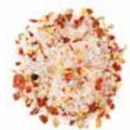
ALL PURPOSE BBQ BLEND