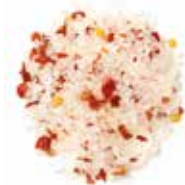
CHILI SALT TOP SELLER