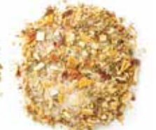
BEEF CAN CHICKEN SPICE