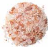
DARK PINK HYMALAYAN SALT TOP SELLER