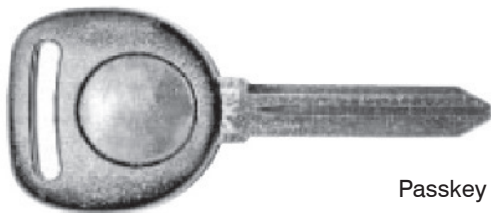
Passkey III (PK3), III+ (PK3+)