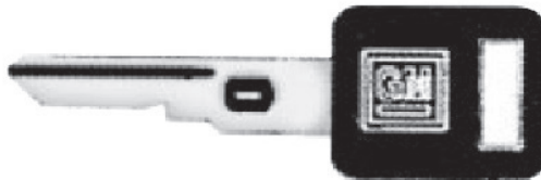
Passkey, Passkey II (PK2)