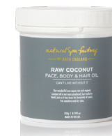
100% RAW ORGANIC COCONUT OIL RRP £20.40