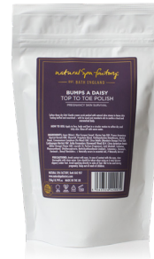
BUMPS A DAISY TOP TO TOE POLISH 250G RRP £16.90