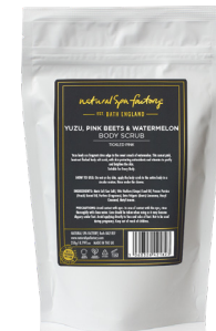
YUZU, PINK BEETS & WATERMELON BODY SCRUB 250G RRP £21.50