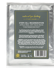
APPLE STEM CELL REGENERATION MASK 25G RRP £8.70