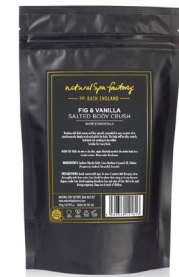
FIG & VANILLA SALTED BODY CRUSH 250G RRP £21.50