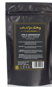
LIME & LEMONGRASS BODY SALT SCRUB 250G RRP £21.50