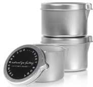
CACAO MASSAGE CANDLE 30G RRP £9.20 PER CANDLE