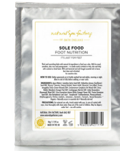
SOLE FOOD FOOT NUTRITION 50G RRP £8.70