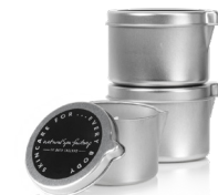
FIG MESSAGE CANDLE 30G RRP £9.20 PER CANDLE