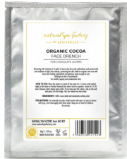
ORGANIC COCOA FACE DRENCH MASK 50G RRP £7.70