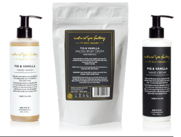
Fig & Vanilla Hand Wash 250ml | 5ltr Fig & Vanilla Salted Body Crush 250g | 5kg Fig & Vanilla Hand Cream 250ml | 5ltr

MASSAGE – feet and lower legs with Fig & Vanilla Hand Cream.