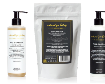
Fig & Vanilla Hand Wash 250ml | 5ltr Fig & Vanilla Salted Body Crush 250g | 5kg Fig & Vanilla Hand Cream 250ml | 5ltr

MASSAGE – feet and lower legs with Fig & Vanilla Hand Cream.