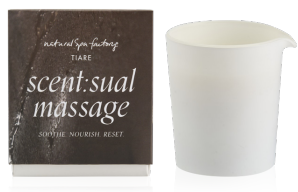
Tiare Monoi Massage Oil Candle 170g