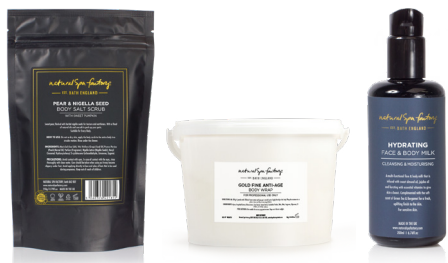
Pear & Nigella Seed Body Salt Scrub 250g | 4kg Ginger, Sweet Orange & Cocoa Bean Body Wrap 2.5kg Hydrating Face & Body Milk 200ml | 1ltr | 5ltr