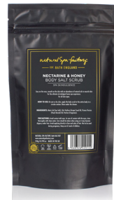
NOURISHING NECTARINE & HONEY BODY SALT SCRUB 250G RRP £21.50