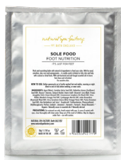
SOLE FOOD FOOT NUTRITION 50G RRP £8.70