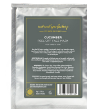
CUCUMBER PEEL OFF FACE MASK 50G RRP £8.70