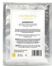
SUPERFRUIT ACTIVE EXFOLIATION 30G – SET OF 2 RRP £18.40