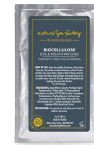
BIOCELLULOSE EYE & MOUTH PATCHES 5G RRP £7.70