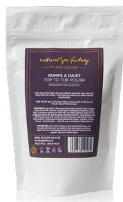
BUMPS A DAISY TOP TO TOE POLISH 250G RRP £16.90