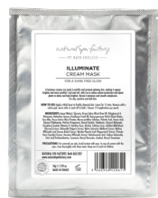
ILLUMINATE CREAM MASK 50G RRP £10.80