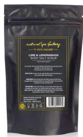
LIME & LEMONGRASS BODY SALT SCRUB 250G RRP £21.50

PROTECT: Face & body – Wanderbalm Raw Organic Coconut Oil.