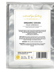
ORGANIC COCOA FACE DRENCH MASK 50G RRP £7.70