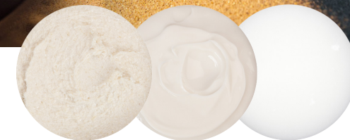
From left to right: Illuminate Body Polish 200g | 1kg Rosemary & Guarana Peel Off Body Wrap 2.5kg Raw Coconut Face, Body & Hair Oil 250g