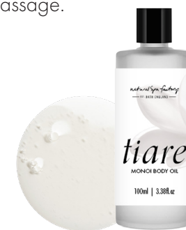
Tiare Monoi Body Oil 100ml

TOP TIP – this oil is a fantastic moisturiser – a great take home item for massages or nourishing moisturiser after a hot bath or for areas of dry skin.