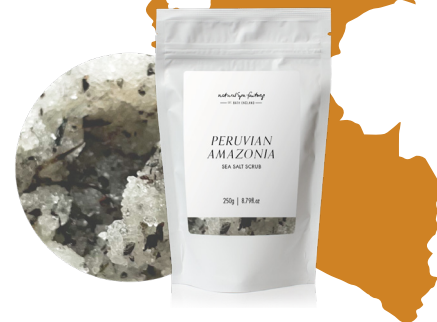
PERUVIAN AMAZONIA PERU

Hawaii is a tropical paradise known for its stunning beaches, lush rainforests, and vibrant culture. The scent of Lime, Mango and Watermelon evoke memories of tropical cocktails, sandy beaches, and warm sun. Pacific Shores Sugar Scrub combines natural sugar with fruity and fresh aromas and is perfect for the summer months. With Melon seed oil, rich in antioxidants and essential fatty acids, it helps to hydrate and nourish the skin. Beets powder, a popular herbal medicine used to help with inflammation and protect against cellular damage – not to mention giving the scrub the most vibrant purple colour, the perfect addition to your scrub collection.