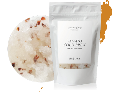
YAMATO COLD BREW JAPAN

One of the most iconic scents associated with Sri Lanka is that of Black tea. Sri Lanka is one of the world's largest producers of Black tea and it is an integral part of the country's culture and economy. The aroma of Black tea leaves being plucked and brewed fills the air and is a treat to the senses. Sri Lankan Black Tea Fine Salt Scrub combines with the added scents of Hibiscus which is rich in antioxidant properties.