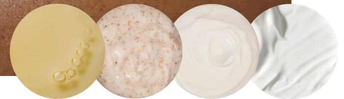
From left to right: Bumps A Daisy Face, Bump & Body Oil 100ml | 1L Bumps A Daisy Top to Toe Polish 250g | 2.5kg Bumps A Daisy Face, Body & Bump Moisturiser 250ml | 1L Sole Food Foot Nutrition 50g | 1L