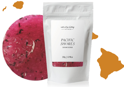
PACIFIC SHORES HAWAII

Pick one or more of our fabulous new scents to add to your scrub bar or seasonal treatment menu. Adding them into existing treatments, creating new and exciting options for your guests or adding into the rasul to reveal glowing beach ready skin.