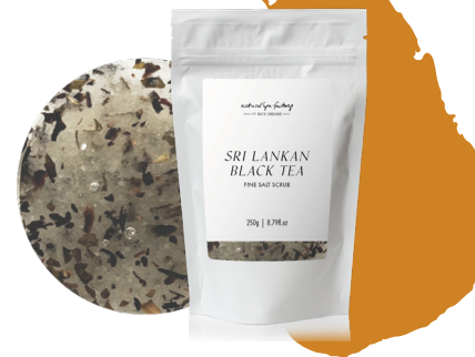
SRI LANKAN BLACK TEA SRI LANKA

Peru is a holiday destination known for its diverse offerings from stunning landscapes and diverse ecosystem where the scents of Coriander, Lime and Mint can be found in local cuisines and traditional medicines. Peruvian Amazonia combines fine sea salt scrub, with uplifting and zesty scents, to take your mind and body straight to Peru. Nourishing to the core with Avocado oil and invigorating Peppermint leaves, perfect for sensitive or super dry skin types.