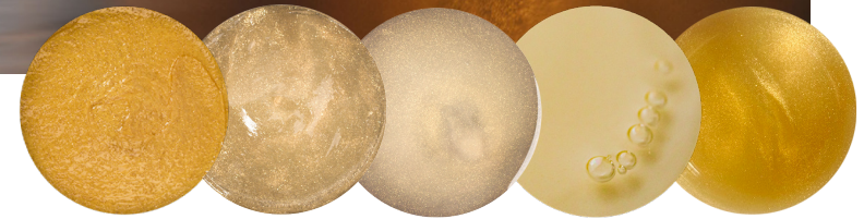
From left to right: Gold & Caviar Body Polish 200g | 1kg Gold Fine Body Wrap 2kg 23c Gold & Caviar Dry Body Oil 100ml | 500ml Golden Jojoba Wax 30ml Luxurious Gold Facial Cleansing Wash 500ml

MOISTURISE – using the shimmering 23 Carat Gold & Caviar Dry Body Oil, creating that golden glow.