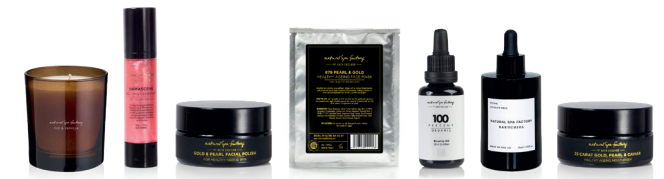
Fig & Vanilla Candle 220g Damascene Melting Cleanser 50ml | 1kg Gold & Pearl Facial Polish 50ml | 500ml Pearl & Gold Face Mask 30g Rosehip Oil 30ml Bakuchiol Facial Oil 50ml