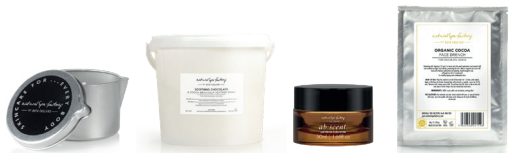
Cacao Flower Massage Candle 35g Chocolate & Cocoa Bean Self-Heating Wrap 2.5kg Ab:scent Unscented Melting Cleanser 50ml | 500ml Organic Cocoa Face Drench Mask 50g

top tip — give your client the remainder of the candle as a gift to take home with them. When offering these treatments consider pairing them with complementary treats, like a cup of hot chocolate or a small box of chocolates making the experience even more special and unforgettable.