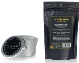
Honey Massage Candle 35g Nectarine & Honey Body Salt Scrub 250g | 5kg

top tip — give your client the remainder of the candle as a gift to take home.