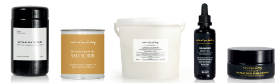
Reviving Himalayan Bath Salts 250g | 650g | 2.5kg Sri Lankan Black Tea Salt Scrub 300g | 4kg Laminaria Body Wrap 2.5kg Seaweed Body Oil 50ml | 1ltr | 5ltr 23 Carat Gold, Pearl & Caviar Moisturiser 50ml | 250ml