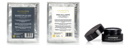
Resurrection Collagen Serum Infused Sheet Mask 23g Green Tea & Jasmine Hair Therapy 30g | 5lir Wanderbalm 20g