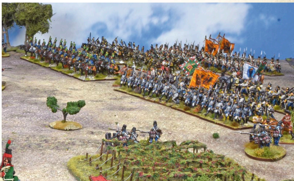
More Austrian reinforcements arrive to push the French from Theiningen. Will they hold until nightfall?

General Bernadotte should be rated at leadership 9. The three brigade commanders should be rated as leadership 8.