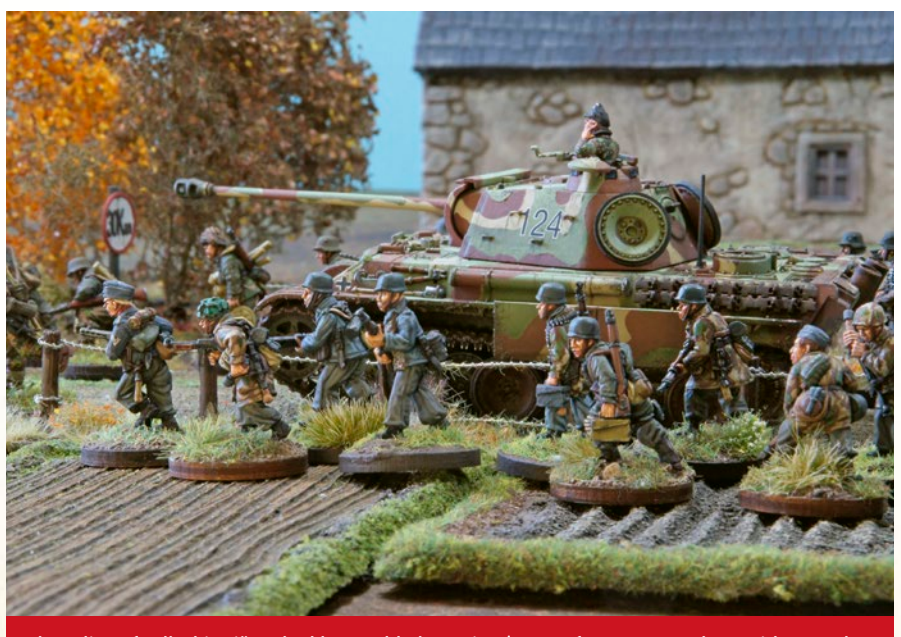
A battalion of Fallschirmjäger had been added to Peiper's Kampfgruppe, seen here with a Panther.

This article is dedicated to the brave men of the 119th US Regiment who fought at Stoumont. With thanks to Deep Cut Studio for making the mud-mat available at short notice.