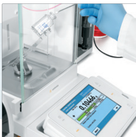
Step 1: Weighing of the compound