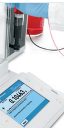
amount of solvent