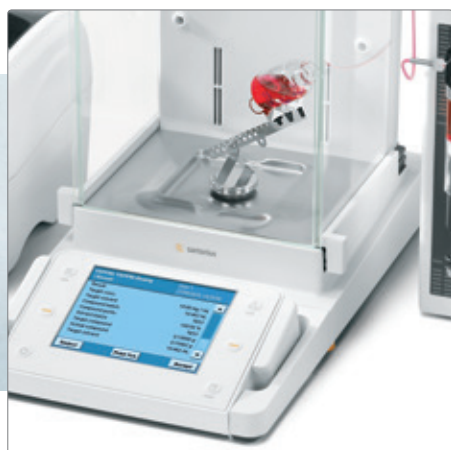
Step 4: Check the achieved results gravimetrically