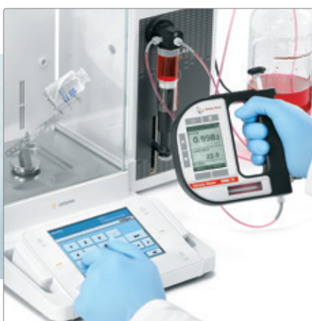
Step 2: Measure the density of solvents