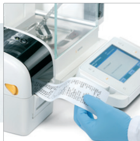
Step 5: Print the results in GLP or label form on self-adhesive paper