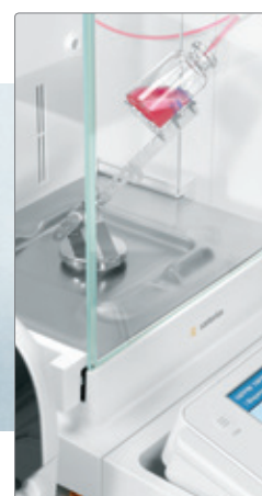
Step 3: Dispense the exact