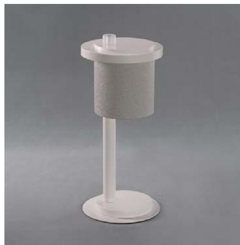
TEXTILE Bianco/Pietra B2012-W01