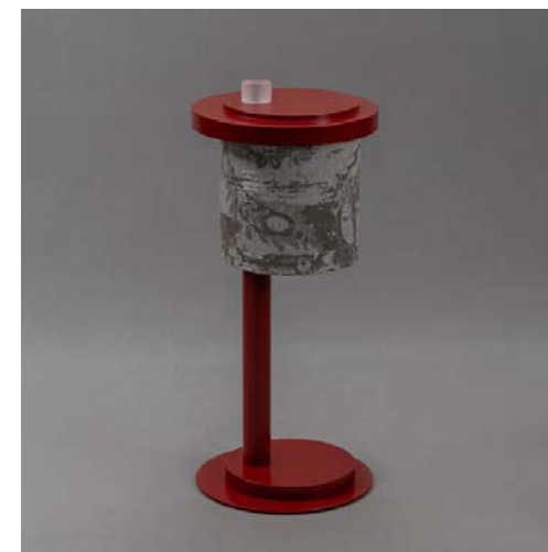
TEXTILE Rosso/Stucco B2012-R12