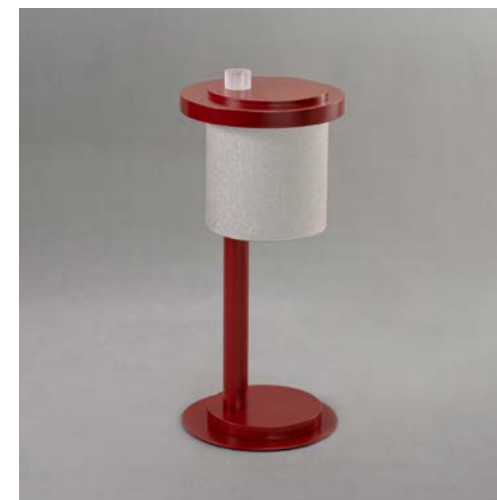
TEXTILE Rosso/Pietra B2012-R02