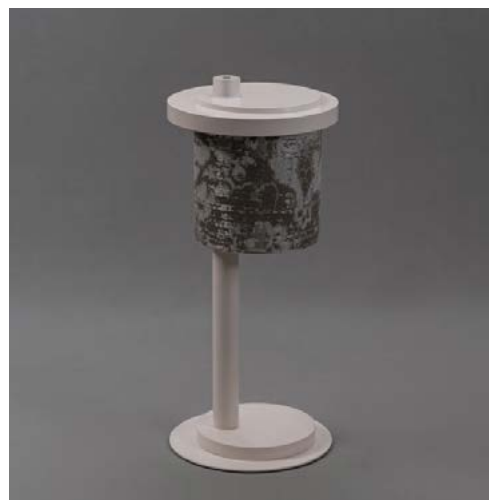
TEXTILE Bianco/Stucco B2012-W11