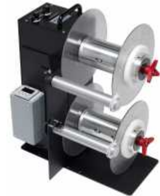
TWIN-CAT-3 with two Quick-Chucks, INSP-1 & PC-1 Options