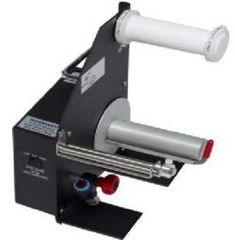
LD-200-RS Label Dispenser