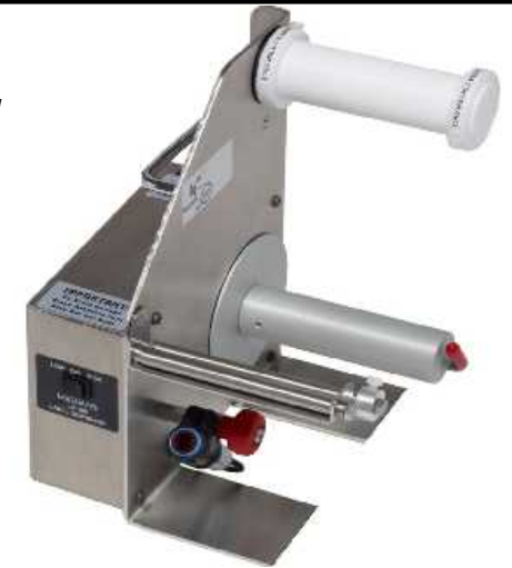
LD-200-RS-SS Label Dispenser