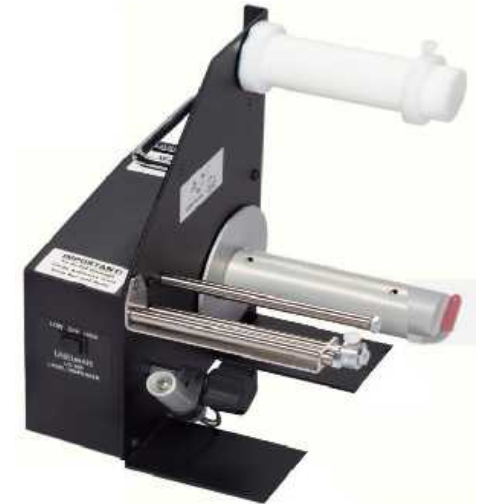
LD-200-U Label Dispenser