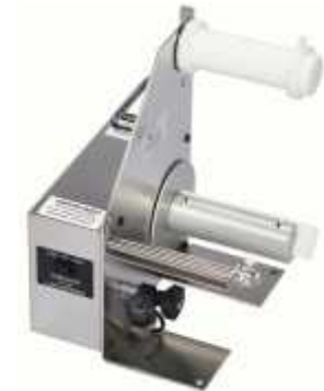
LD-100-RS-SS Label Dispenser