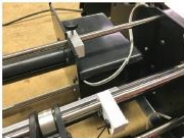
Remove Screws from Mounting Blocks