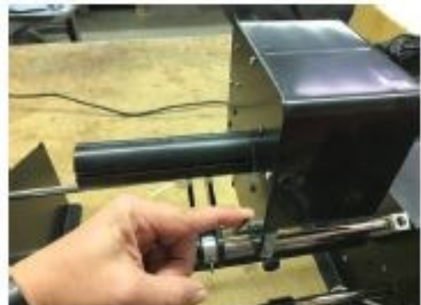
Locate and tighten