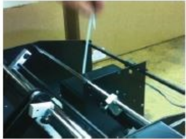
Cut Zip-tie, remove Roll Holder Rod