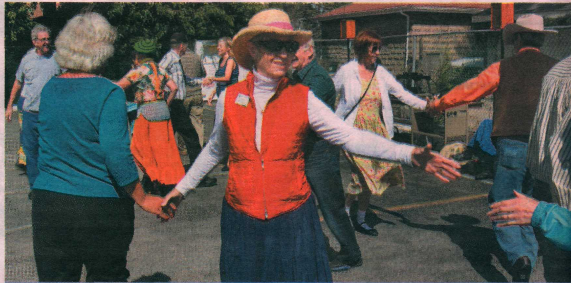
Morton Grove residents learn how to square dance at the Morton Grove Library’s How-to Fest on Sept. 14, 2014.

the “smoky eye” look with makeup, practice basic yoga poses, shoot a basketball, and select craft beers.