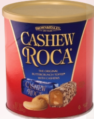
F-05690 腰果杏仁糖 10安士圓罐裝