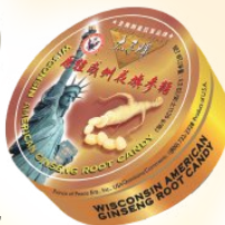
A-1124 金罐原粒 花旗參糖 120克 (自由女神)