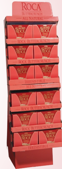
F-01570 Display 48ct