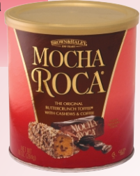
F-05670 摩卡杏仁糖 10安士圓罐裝