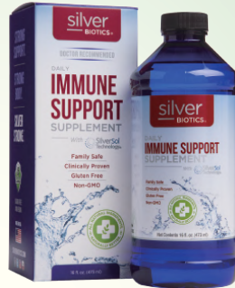
M-07047 銀免疫力提升液 16安士