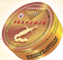
A-1118 金罐原粒花旗參糖 120克