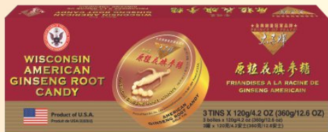
A-1119 禮盒金罐裝原粒花旗參糖 (3金罐/禮盒)