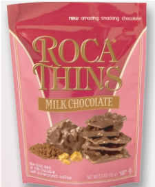
F-05655 牛奶巧克力薄片 5.3安士鋁袋裝