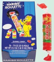
F-37754 酸雙蛇5安士 F-38085 蜜桃5安士 F-38225 雜果沙拉5安士 F-47273 迷你彩色青蛙5安士 F-47254 青蛙5安士 F-37216 條裝25克