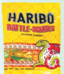
F-30216 酸味叮4.5安士 F-32363 開心可樂5安士 F-32398 趣緻可樂5安士 F-34121 恐龍5安士 F-35888 酸麵條5安士 F-36905 英文字母5安士 F-37702 彩蛇5安士