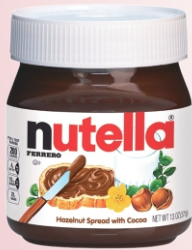
F-89371 榛子果仁醬 13安士膠瓶裝