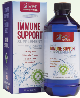
M-07046 銀免疫力提升液 8安士