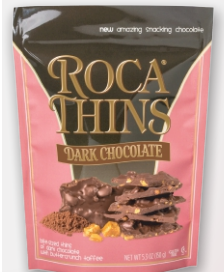
F-05656 黑巧克力薄片 5.3安士鋁袋裝