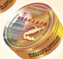
A-1126 金罐原粒 花旗參糖 120克 (國會大廈)