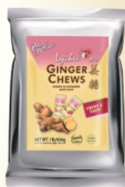
F-04006 荔枝味 454g