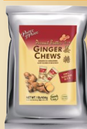
F-04008 花生醬 454g