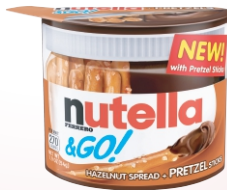
F-80401 脆餅棒 1.9安士