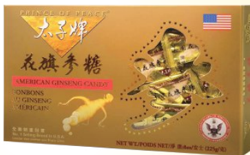
A-1115L 金盒裝花旗參糖 8安士