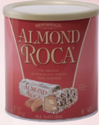
F-05671 杏仁糖 10安士圓罐裝