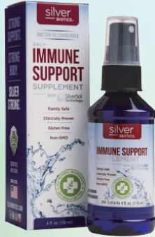
M-07045 銀免疫力提升液 4安士 (噴劑)