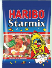
F-30214 酸彩帶4.5安士 F-30215 西瓜4.1安士 F-30211 姜檸檬4安士 F-30500 藍精靈4安士 F-30504 酸藍精靈4安士 F-31220 酸熊仔4.5安士 F-30210 熊仔5安士 F-30213 明星組合5安士