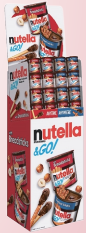
F-88011 榛子手指餅展示裝 96瓶