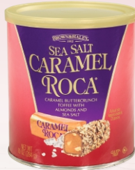
F-06640 海鹽焦糖杏仁糖 10安士圓罐裝