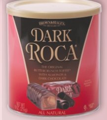
F-03460 黑巧克力杏仁糖 10安士圓罐裝