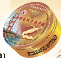
A-1125 金罐原粒 花旗參糖 120克 (金門大橋)