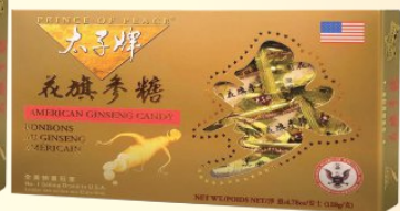
A-1116S 金盒裝花旗參糖 4.78安士