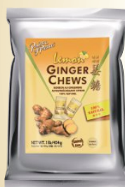
F-04002 檸檬味 454g