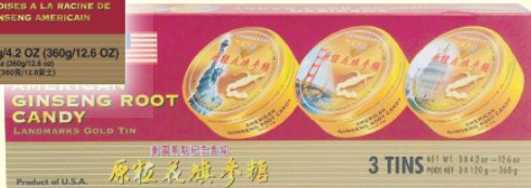
A-1129 禮盒金罐裝原粒花旗參糖 (美國風景)