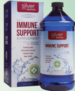
M-07048 銀免疫力提升液 32安士