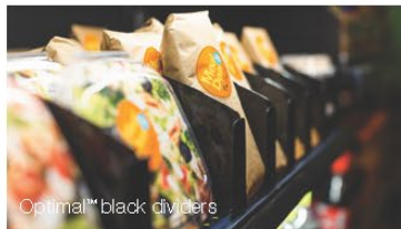
Optimal™ black dividers