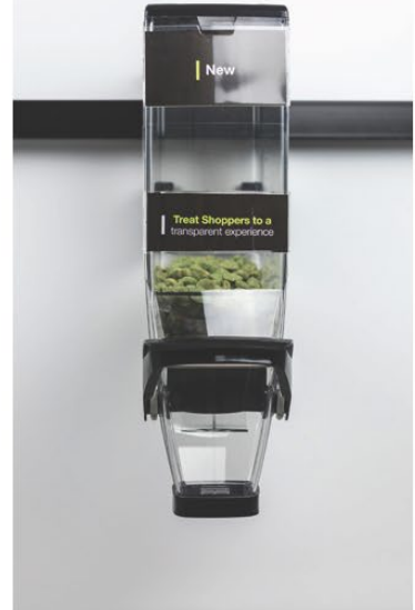
4eBin™ - Gravity Bin