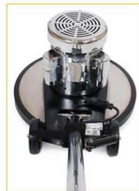
Quick disconnect pigtail

Hi torque, totally enclosed, fan cooled motor handles dust, moisture and other harsh conditions