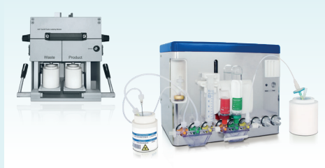
iQS® Ga-68 Fluidic Labeling Module