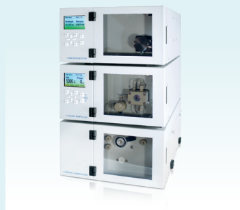
Quality Control Solution