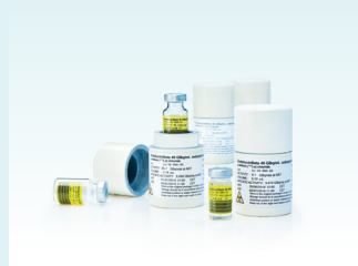
Radioisotopes + Biomolecules

Take advantage of our one-stop-shop offering: Get all components and services from one supplier!