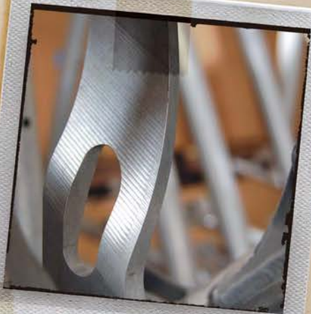
Turner DHR Shock Brace

Fifteen Years of building high-precision bikes for devoted riders