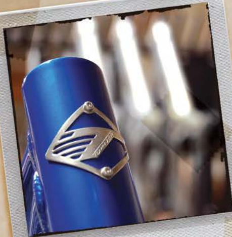
Turner Stainless Headbadge

Turner Bikes has been American made since 1993