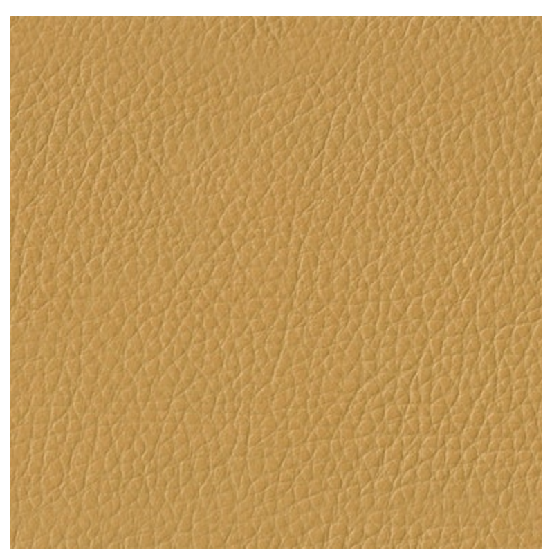
Close Up (Maize, Raise Leather)