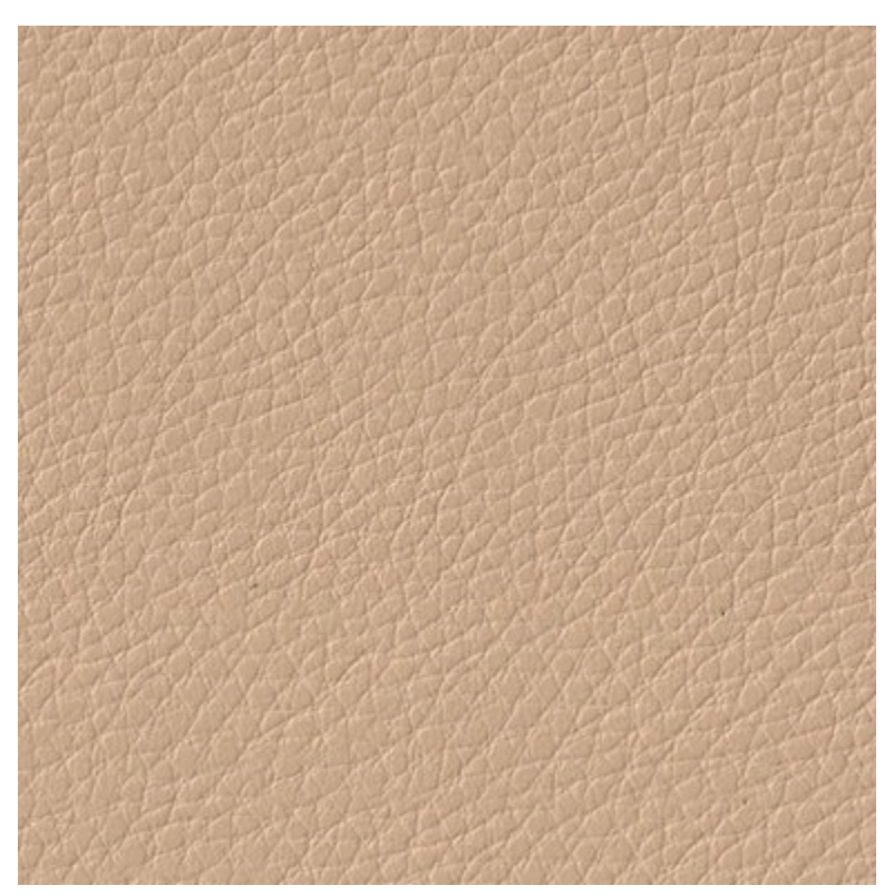
Close Up (Balsa, Prone Leather)