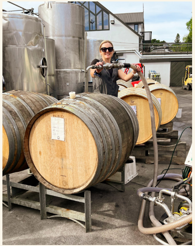
Barrelling down Chardonnay from the 2023 harvest.

Summer came in fits and starts, a stint of 30+ degree days in late January sandwiched between cooler spells. Autumn then threw up a mix of sunny days, followed by frequent southerlies, sending the mercury yo-yoing once again.