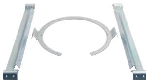
C-Ring / V-Rails

NOTE: IT IS MANDATORY THAT THIS SECONDARY SUPPORT BE UTILIZED IN DROP CEILINGS FOR SAFETY AND SEISMIC CONSIDERATIONS.