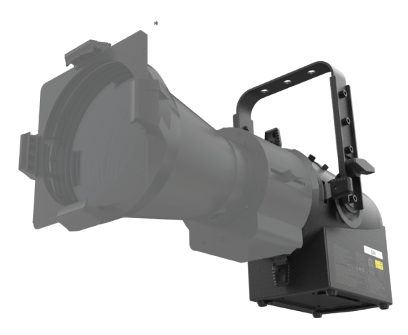
*shown with optional lens tube

The VL600 Acclaim PLE WW is a 500W / 650W-equivalent fixed white 3200k profile light engine perfect for Front of House positions where color is not needed in small to medium theatres, houses of worship, and education environments. With exceptional output in a fixed warm white luminaire, it is designed for applications where a longer throw or wider spread is needed. Because the VL600 PLE WW works with Vari-Lite's wide range of fixed and zoom lens tubes, ensuring there is a lens for any application. With the onboard fourblade manual shutter system, the VL600 PLE WW offers superior control to shape the light how you want it. Thanks to the optional size B metal gobo holder, designers can project depth and texture on stage, using the angle adjustment and manual focus to get the look just right. For applications where a low trim height is a challenge, the adjustable yoke allows the fixture to be positioned closer to the suspension point to give more headroom. The VL600 Acclaim PLE WW is available in black or white.