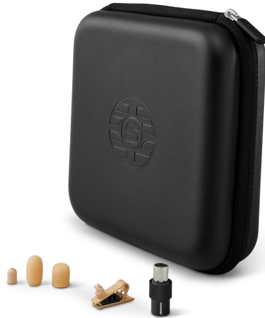
Headset Accessory Kit For MTQG SKUs (shown in tan)