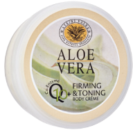
F0305 - Aloe Vera Q10 Firming & Toning Body Crème 250ml