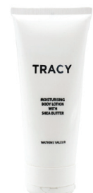
F0559 - Tracy Lotion with Shea Butter 100ml