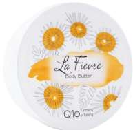
F0329 - La Fievre Body Butter Q10 Toning & Firming 250ml