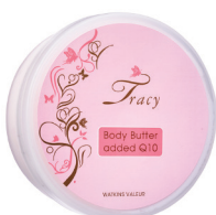
F0551 - Tracy Q10 Firming & Toning Body Crème 250ml