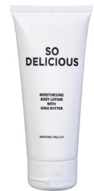
F0728 - So Delicious Lotion with Shea Butter 100ml