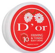
F0319 - D'or Q10 Firming & Toning Body Crème 250ml