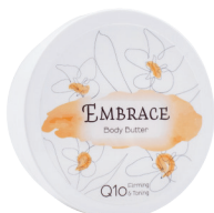
F0650 - Embrace Body Butter Q10 Toning & Firming 250ml