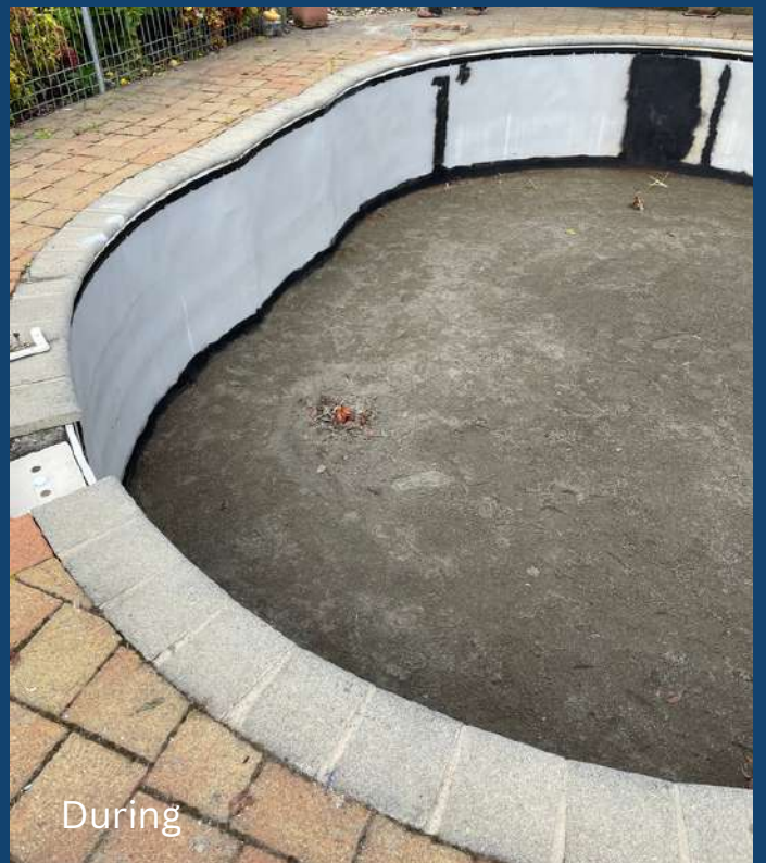
Paramount Pool liner using clipping system in Maui