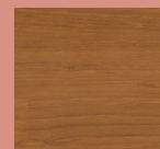
ASIAN GOLDEN TEAK