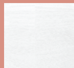
ENGLISH WHITE ASH

The Embroidery Center comes in four elegant finishes*, each as stunning as it is durable. The thick vinyl veneer provides premium scratch- and water-resistance, and is easy to clean. Choose the color that best complements your home décor, style, and creativity.