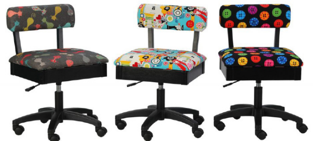
Cat's Meow, Sew Wow Sew Now & Bright Buttons Chairs

The cherry on top of your sewing sundae! Arrow's #1 Rated Height Adjustable Sewing Chair is a must have accessory for your dream sewing room! Cute, comfortable and convenient - our lovable chairs feature vibrant sewing themed patterns, 360° swivel access and lumbar support for long hours at your workstation. Don't look now, but under every seat cushion is a hidden storage compartment to store your notions and patterns! Available in 10 colors to perfectly match your sewing sanctuary!