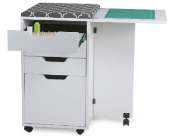
Kiwi Storage Cabinet

Every dream sewing oasis needs functional, dependable accessories! Add even more convenience with a storage cabinet like Kiwi , featuring a built-in ironing board, cutting mat, thread drawers and a dedicated drawer to store your iron! Your dream sewing space won't be the same without it!