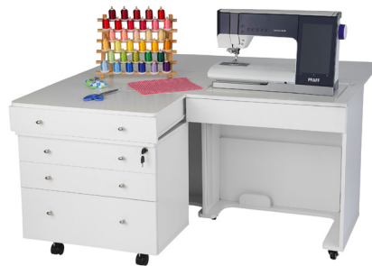
Kangaroo & Joey II Sewing Cabinet

Kangaroo sewing cabinet - check! Now complete your studio with Kangaroo storage and cutting furniture, specially designed to complement your primary workstation. With extra storage and workspace, you can customize your sewing room to be stylish, comfortable, and even more productive!