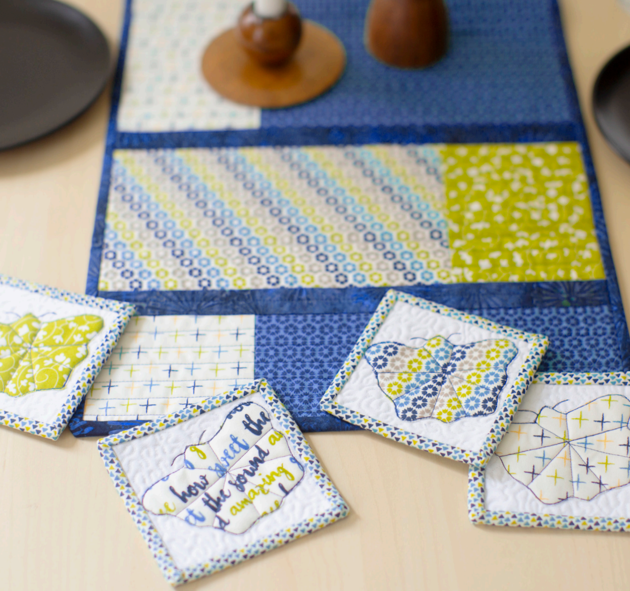
Diane Kron • "Table Tranquility"