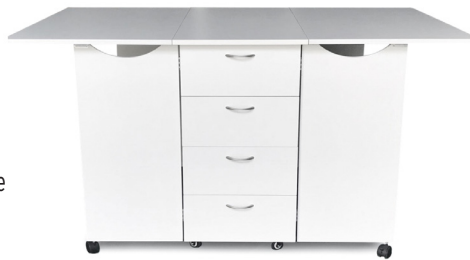
Kookaburra Cutting Table

Kangaroo sewing cabinet - check! Now complete your studio with Kangaroo storage and cutting furniture, specially designed to complement your primary workstation. With extra storage and workspace, you can customize your sewing room to be stylish, comfortable, and even more productive!