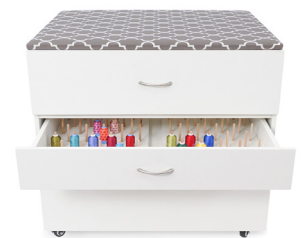
MOD Embroidery Storage Cabinet

Every dream sewing oasis needs its cute, dependable accessories! Add even more convenience with MOD Embroidery Storage Cabinet - featuring dedicated storage for your embroidery machine, a built-in ironing board and expansive thread drawers! Your dream sewing space won't be the same without it!