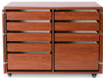
Dingo II Cutting Table

Kangaroo sewing cabinet - check! Now complete your studio with Kangaroo storage and cutting furniture, specially designed to complement your primary workstation. With extra storage and workspace, you can customize your sewing room to be stylish, comfortable, and even more productive!