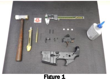
Step 1: Read the entire instructions before attempting the installation of the Trigger Pack.

Tools and Supplies Required: A non-marring hammer, a sharp "box cutter" type knife, a non-marring punch, a 0.050" allen wrench, calipers, moderate thread locker, a customer supplied lower receiver, and customer supplied hammer and trigger pins. (See Figure 1)