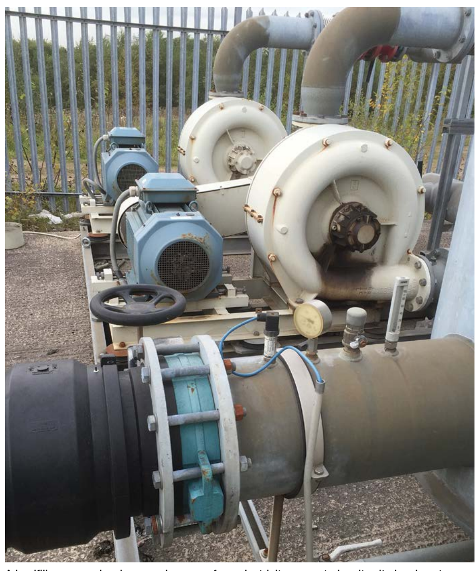
A landfill company has increased revenue from electricity generated on its site by almost £17,000 per year with ABB drives.

The site produces 40,000 MW of green electricity a year, enough to power up to 4,000 homes. This is sold by Patersons to Scottish Power Distribution, producing a significant income stream for the site.