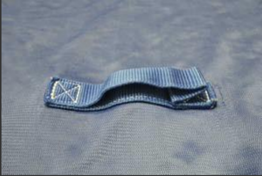
Handle with Permanent Crease

In addition to the loop straps, the back strap and sling handles if present will also show the permanent creases. Permanent creases will tend towards its original wrinkled position even when stretched out.