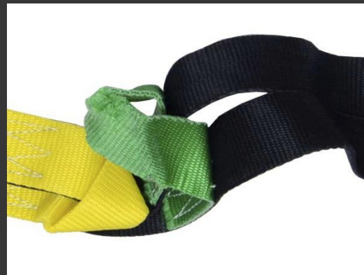
Stiffened and Brittle Loop Strap

Permanent crease, wrinkles along with brittleness increase chance that the fabric will suffer more damage from abrasion, internal fiber abrasion as well as external abrasion with other objects. Wash cycles with excessive agitation will increase abrasion and degradation of the fabric.