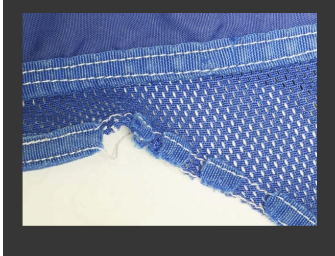
Edge Binding Decomposition

Decomposition of Edge Binding and other components of the sling are clear indicators of degradation from chemical treatment. Color loss and a chalky appearance is common. Stitching (comprised of a different material) may still be intact.