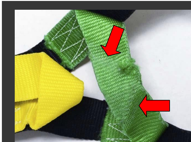
Surface Abrasion at Creases

Surface Abrasion / Color Loss especially at creases or areas frequent use. Stiffened or brittle fabric will usually wear excessively around the creases and areas that come into frequent contact with other object. The surface and edge abrasion is a result of this and will usually be accompanied by loss of color with a chalky appearance