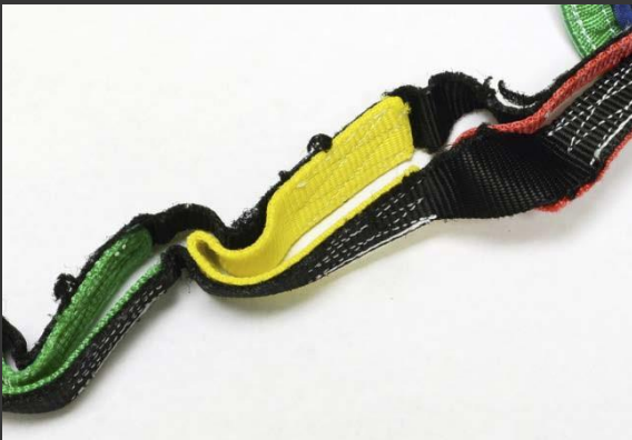
Loop Strap with Excessive Edge Abrasion

Strap Brittleness / Stiffness / Surface and Edge Abrasion are additional indicators that the sling may have been laundered in unsuitable conditions and has loss tensile strength. Loop straps that have stiffened or become brittle will tend remain in the state, position, or shape it is bent into instead of returning into a normal relaxed state.