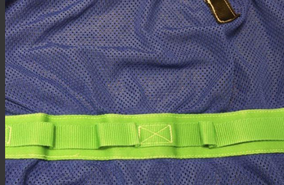
Back strap with Permanent Crease