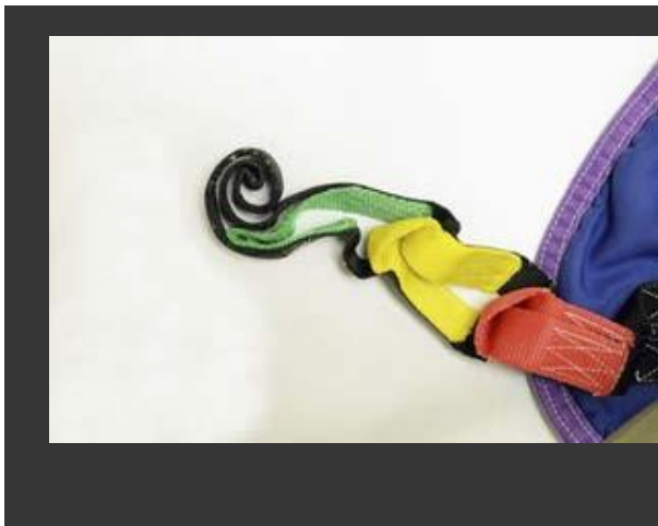
Extreme Loop Strap Curling

Extreme Curling / Permanent Wrinkles of loop straps can set in when the slings are dried at high heat or dried over an extended period of time. Heat combined with bleach or other chemicals will intensify the chemical action.