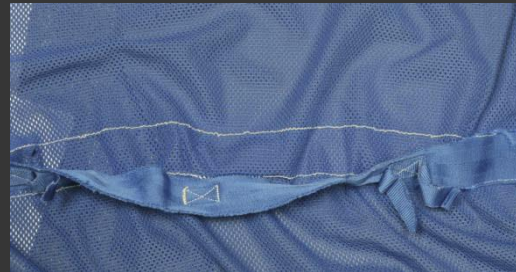
Back/Handle Strap Decomposition