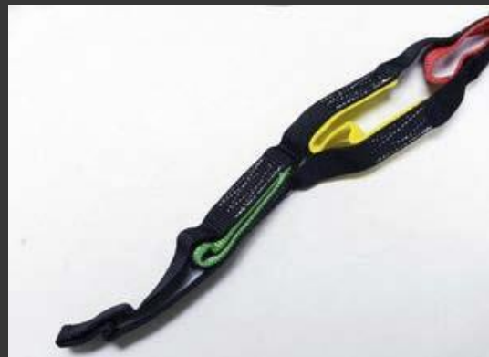
Permanent Creasing of Loop Strap