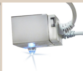
Under Bed Lighting