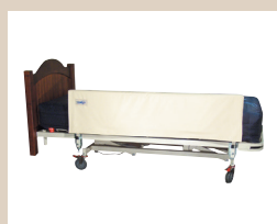
COT PRO Padded Side Rail Protectors