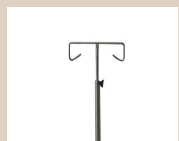
AIVP I.V. Pole