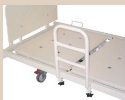
CLP400 Clamp On Support Rail 400mm