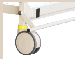
CLOK 125mm Central Locking Castors