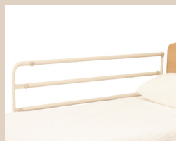
400HR Deluxe Rails