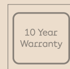
10 year frame warranty