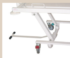
TBR7000 T Bar Buffer