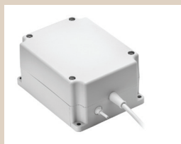
ABB Battery Backup