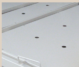
Sheet Metal Mattress Base