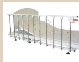
380VR Vertical Side Rails 380VR-H High Deluxe Vertical Rails