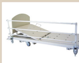
360HR Horizontal Side Rails