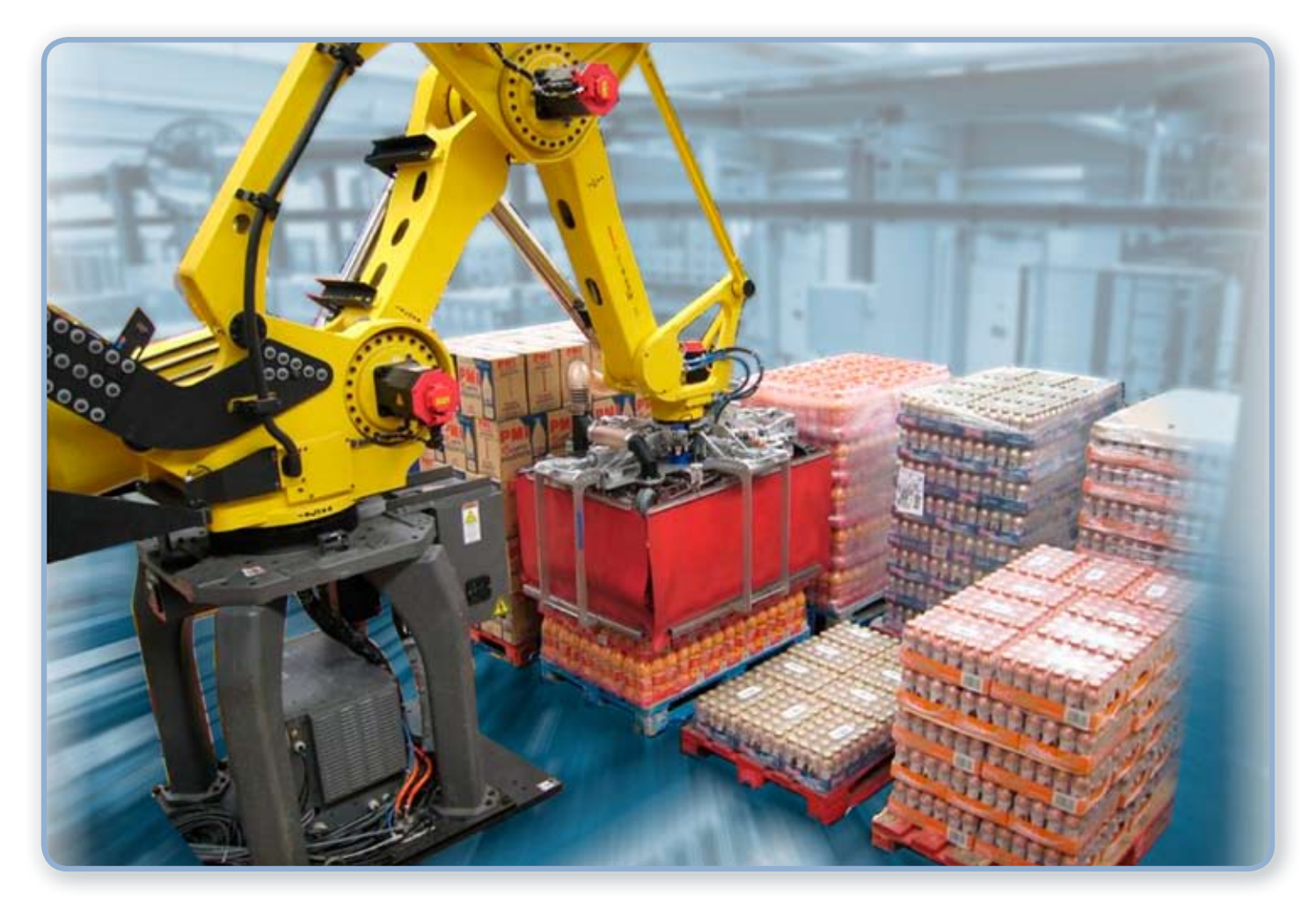
Multi-powered layer handling tool for distribution centres