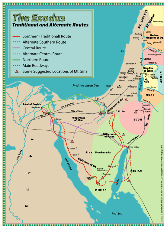
1—Edom resisted Israel's progress to the promised land. Edom resisted Israel's march to the promised land, Numbers 20.

The message of Obadiah is two-fold. The book opens with a decree of doom: Edom will be destroyed because of its pride and neglect of coming to the aid of Israel who had been attacked by foreigners. The second message focuses