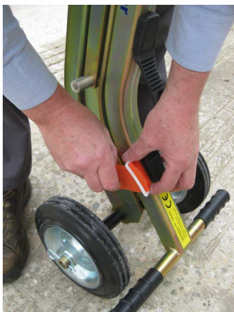
Refit Velcro strap