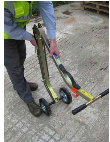
Raise front section