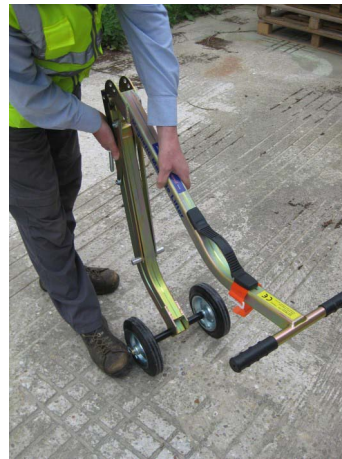
Fold handle section forward