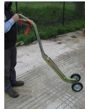
Straight handle (left) is most common configuration. Cranked handle (right) may be useful on raised covers