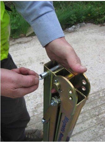
Remove locking pin