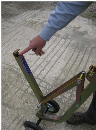
Push front arm forward ..