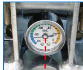
Strong ! Recharge