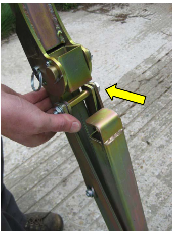
Press stay bars inwards to release front arm