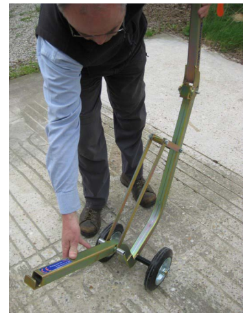
... until stay bars are straight

Before using the lifting trolley, check all pins and bolts are in place and secure Inspect for any visible signs of misalignment or damage