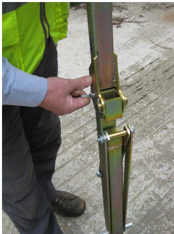
Remove locking pin