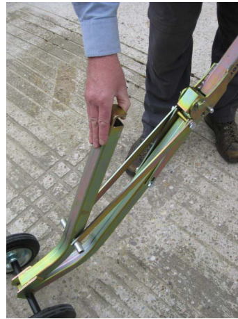
Fold front arm back against frame