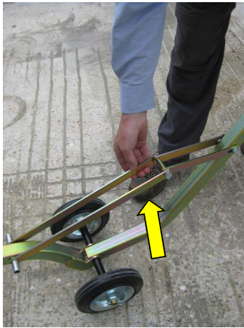
Raise front arm by lifting stay bars in front of joint