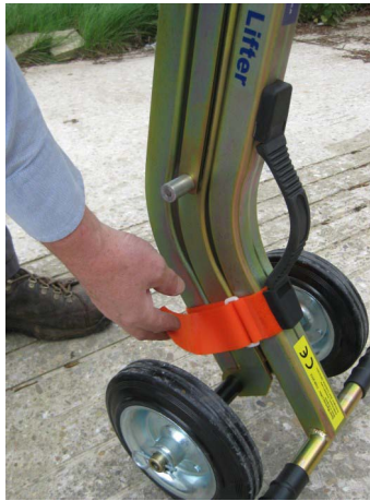
Undo Velcro strap