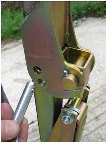
Insert locking pin (see right for alternatives)