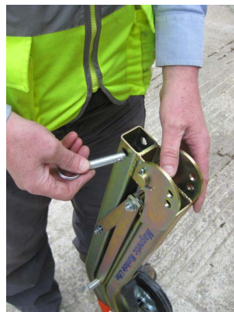
Replace locking pin on frame

Take care to avoid pinching or trapping fingers when folding the trolley